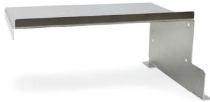
48" Half Shelf ITD1342

This full length shelf doubles the useable space of your 36" tool box. This full length, all-aluminum shelf is 14" deep. All necessary mounting hardware is included. With our Pro Series™ Tool Box accessories there's no drilling required, just pop out the plastic plugs and bolt the shelf. (Don't forget to add ITD1118 upper shelf dividers for even more organization.)