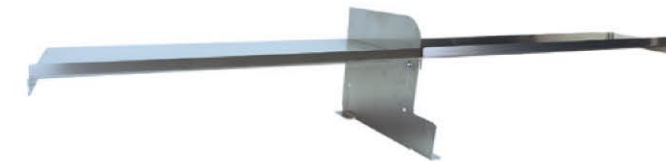
70" Full Length Shelf Kit ITD1286

This 70" Half Shelf is a great choice if you want a half shelf on one half of your box and a Slide In Jack Bracket on the other half. The Half Shelf comes complete with one 14" deep shelf, a vertical support and all necessary mounting hardware. With our Pro Series™ Tool Box accessories there's no drilling required, just pop out the plastic plugs and bolt the shelf - it's really that easy. (Don't forget to add ITD1118 upper shelf dividers for even more organization.)