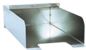
Slide In Jack Bracket ITD1284

This Full Length Shelf comes with two half shelves giving you the option to use as a half shelf or a full shelf. This ITD1287 Full Shelf Kit comes complete with two 14" deep shelves, a vertical support and all necessary mounting hardware. With our Pro Series™ Tool Box accessories there's no drilling required, just pop out the plastic plugs and bolt the shelf - it's really that easy. (Don't forget to add ITD1118 upper shelf dividers for even more organization.)