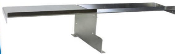
48" Full Length Shelf Kit ITD1287

This Half Shelf is a great choice if you want a half shelf on one half of your box and a Slide In Jack Bracket on the other half. This Half Shelf comes complete with one 14" deep shelf, a vertical support and all necessary mounting hardware. With our Pro Series™ Tool Box accessories there's no drilling required, just pop out the plastic plugs and bolt the shelf - it's really that easy. (Don't forget to add ITD1118 upper shelf dividers for even more organization.)